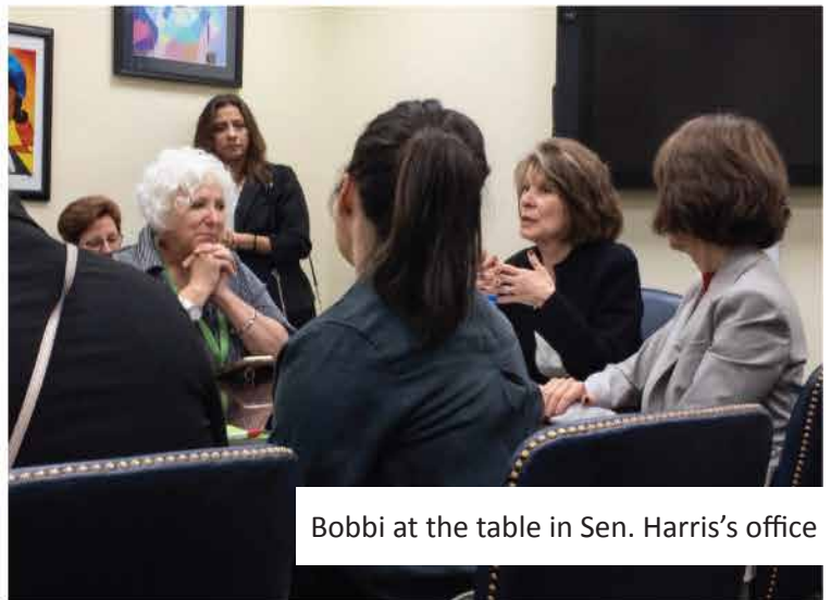
Bobbi at the table in Sen. Harris's office