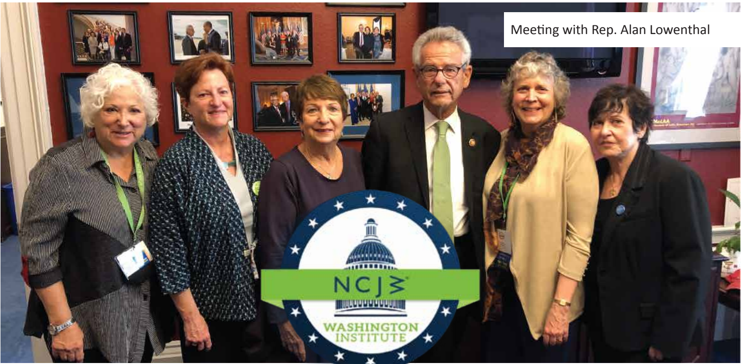
Meeting with Rep. Alan Lowenthal