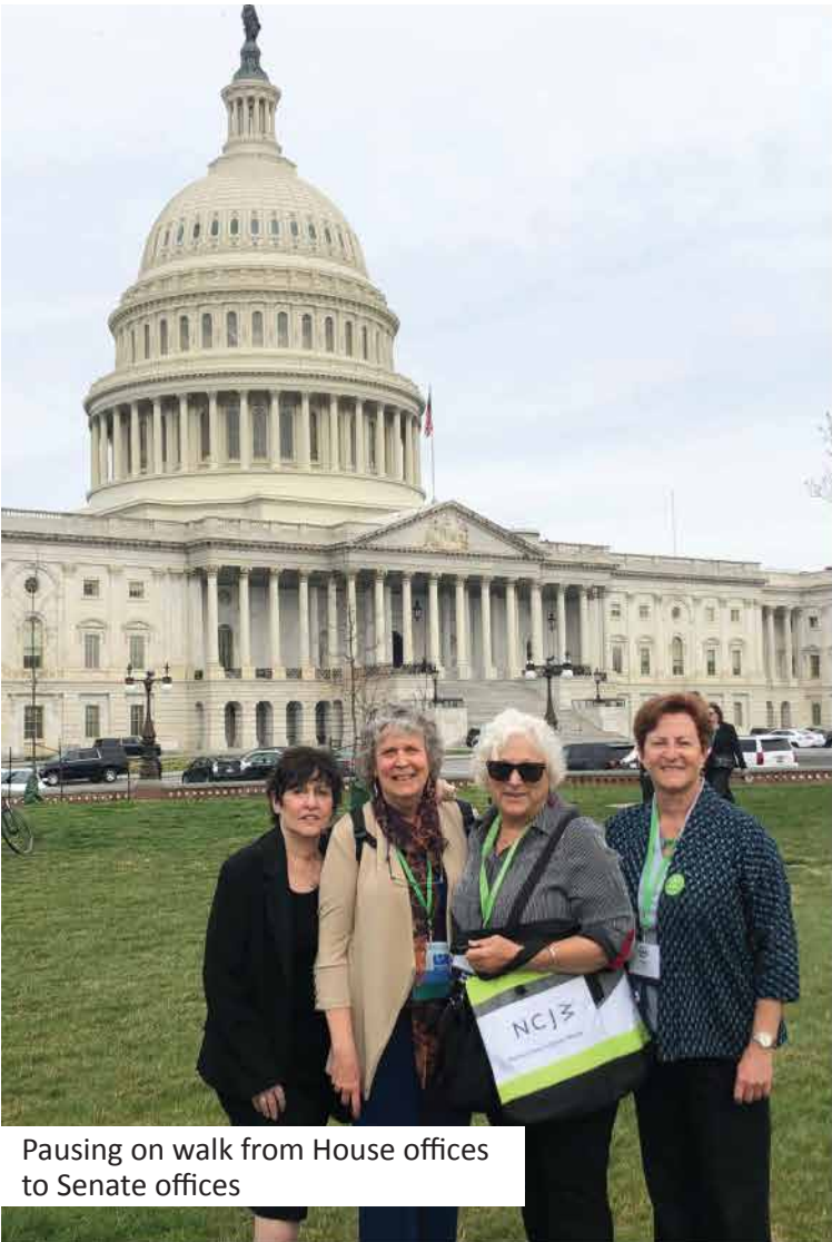
Pausing on walk from House offices to Senate offices